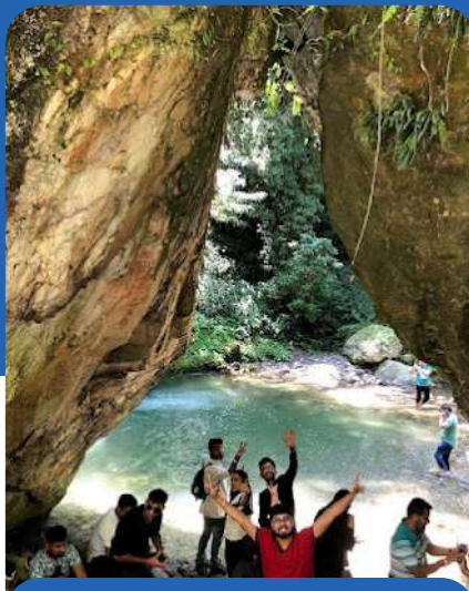
Jibhi & Tirthan Valley