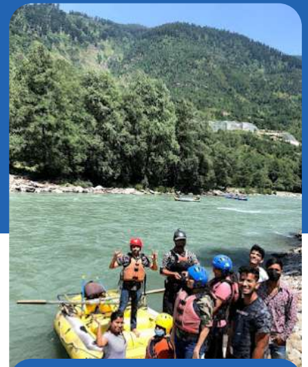
Manali & Solang Valley